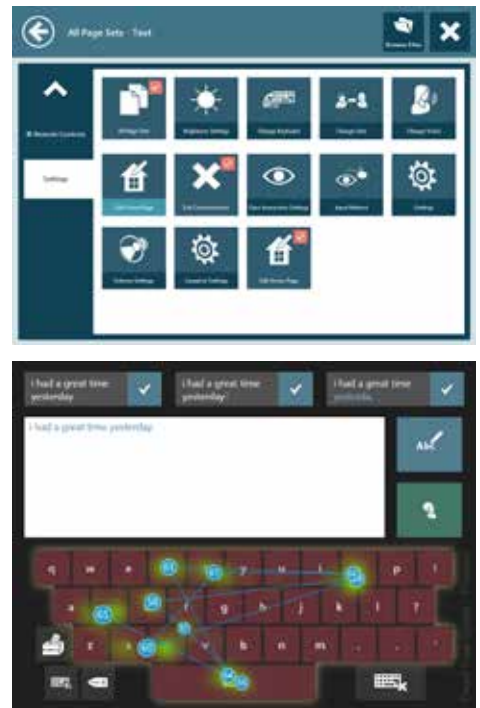
The "Quick Menu" gives caregivers access to the most commonly used settings and functions in Communicator 5. On the bottom right you can see the new "dwell-free" keyboard in action.