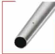
SonaStar aspiration tips