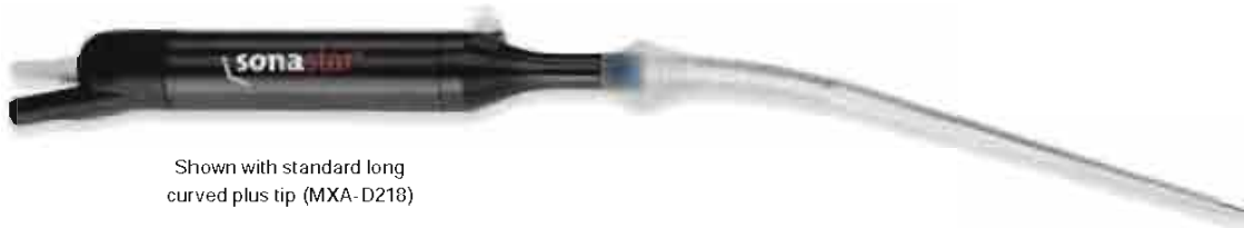
Shown with standard long curved plus tip (MXA-D218)

The SonaStar Short Straight is an advanced 23 kHz handpiece that combines high performance with maximum flexibility. It delivers ultrasonic power in a compact design engineered for effective tissue removal. It accepts the entire tip portfolio for hard and soft tissue ablation and can be configured for a variety of surgical approaches. The Short Straight handpiece delivers up to 230 microns of amplitude.