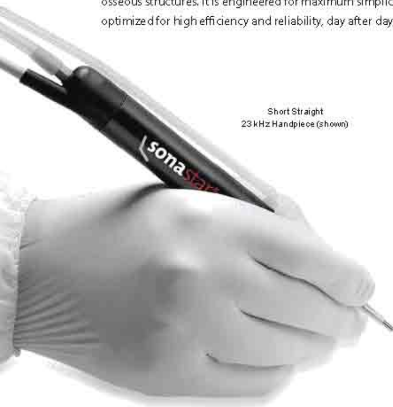
Short Straight 23 kHz Handpiece (shown)

The SonaStar ® is an advanced ultrasonic system for precise soft tissue aspiration and powerful removal of osseous structures. It is engineered for maximum simplicity and intuitive use. All ultrasonic components are optimized for high efficiency and reliability, day after day, case after case.