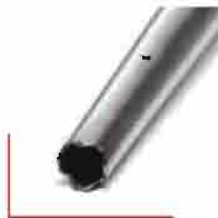
SonaStar specialty aspiration tips