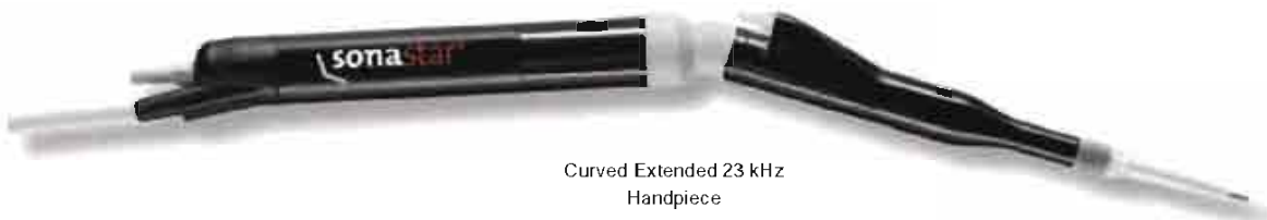
Curved Extended 23 kHz Handpiece

The SonaStar Curved, Extended handpiece is designed to provide clearance for use with a microscope. Additionally, the handpiece is well balanced, and its curved shape improves ergonomics by reducing hand fatigue over extended periods of use. It provides an amplified tip stroke for more efficient removal of fibrous or calcified structures. The Curved, Extended handpiece delivers over 300 microns of amplitude.