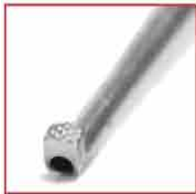
OsteoSculpt® bone shavers (long)