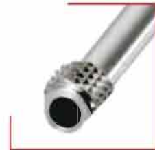
OsteoSculpt bone shavers (short)