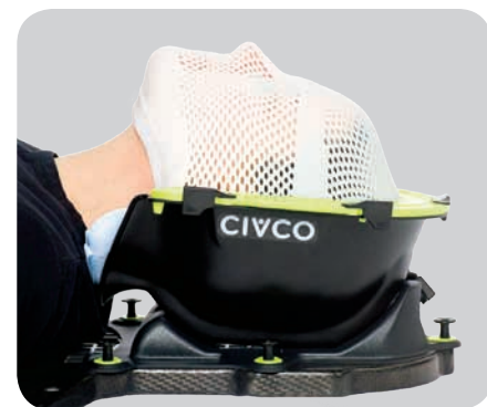
Pitch at 10 (chin up)