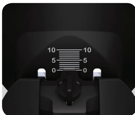
Pitch indexing options 0 to 10