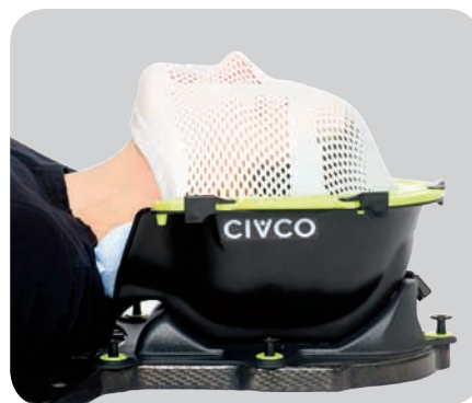
Pitch at 5 (neutral)