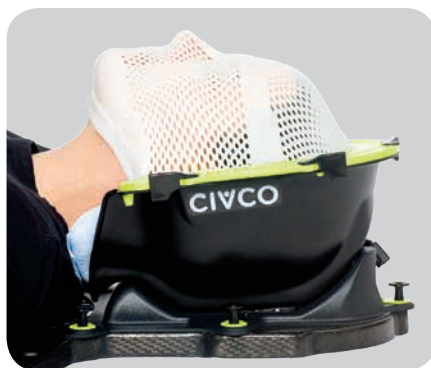
Pitch at 0 (chin down)